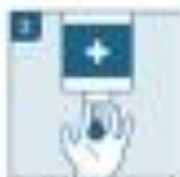
Use enough soap to cover all hand surfaces