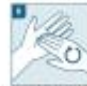
Rotational rubbing backwards and forwards with clasped fingers of right hand in left palm and vice versa