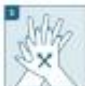
Pairs to palm with fingers interlaced