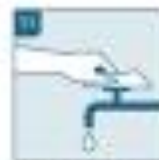
Use the towel to turn off the tap