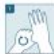
Rotational rubbing of right thumb clasped in left palm and vice versa