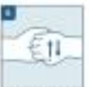
Backs of fingers to opposing palms with fingers interlocked