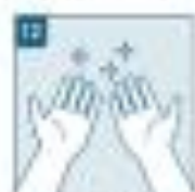
Your hands are clean