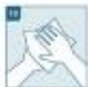
Dry hands thoroughly with a single use towel